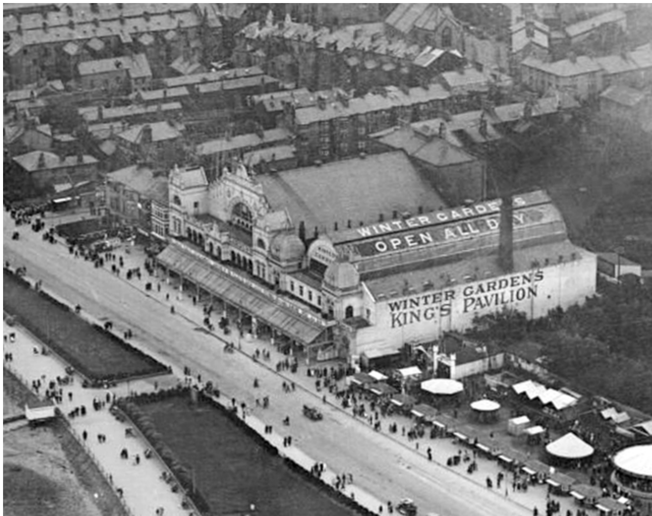
Winter Gardens with the Ballroom nearest