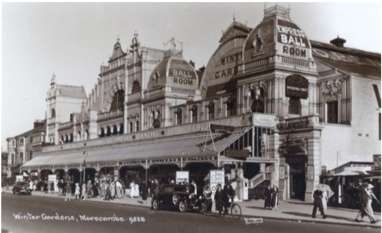
Winter Gardens, Morecambe - 9528