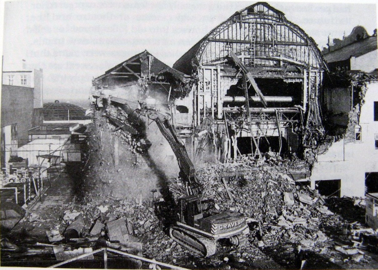
Ebb: The End of the Peoples' Palace: demolition of the Winter Gardens Ballroom 1982