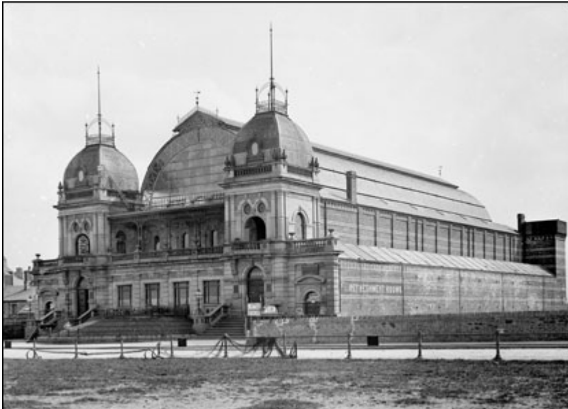
The ballroom before the theatre was built